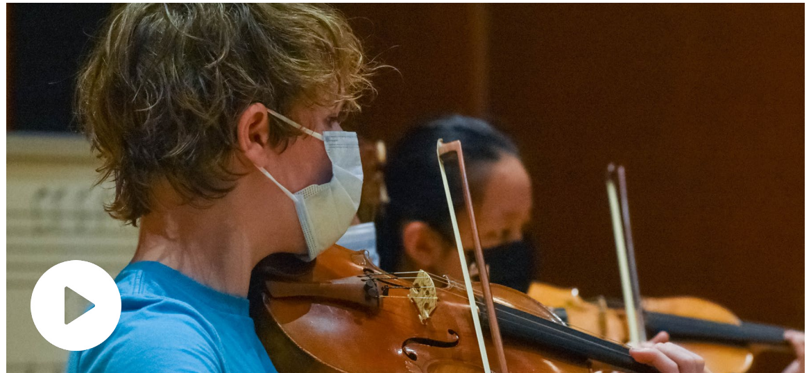
Suzuki Cello Rock and Vivace Violin Camp Performance

MacPhail Suzuki students, teachers, and parents enjoy a long-term, collaborative learning experience. Only at MacPhail can students experience a summer strings camp that includes a joint concert with a Suzuki Cello Rock group and a Suzuki Vivace Strings group. It's a lively combination! The MacPhail Suzuki program is a close-knit community where students build lifelong friendships along with their musical skills.